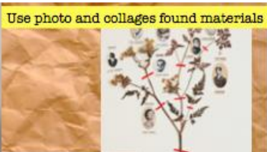
Use photo and collages found materials