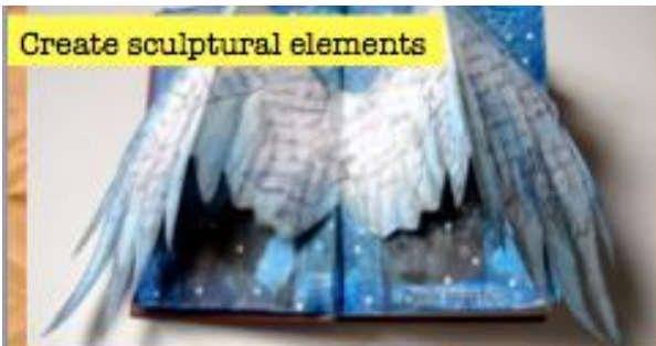
Create sculptural elements

Communicate accounts, feelings, emotions or world events and news... Use a combination of text and imagery... Drawing and painting over photos can create interesting effects